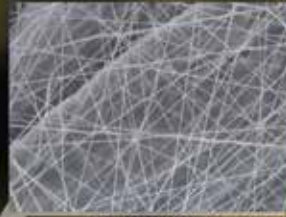
DeltaMAXX ™ Nanofiber Technology at 5000x